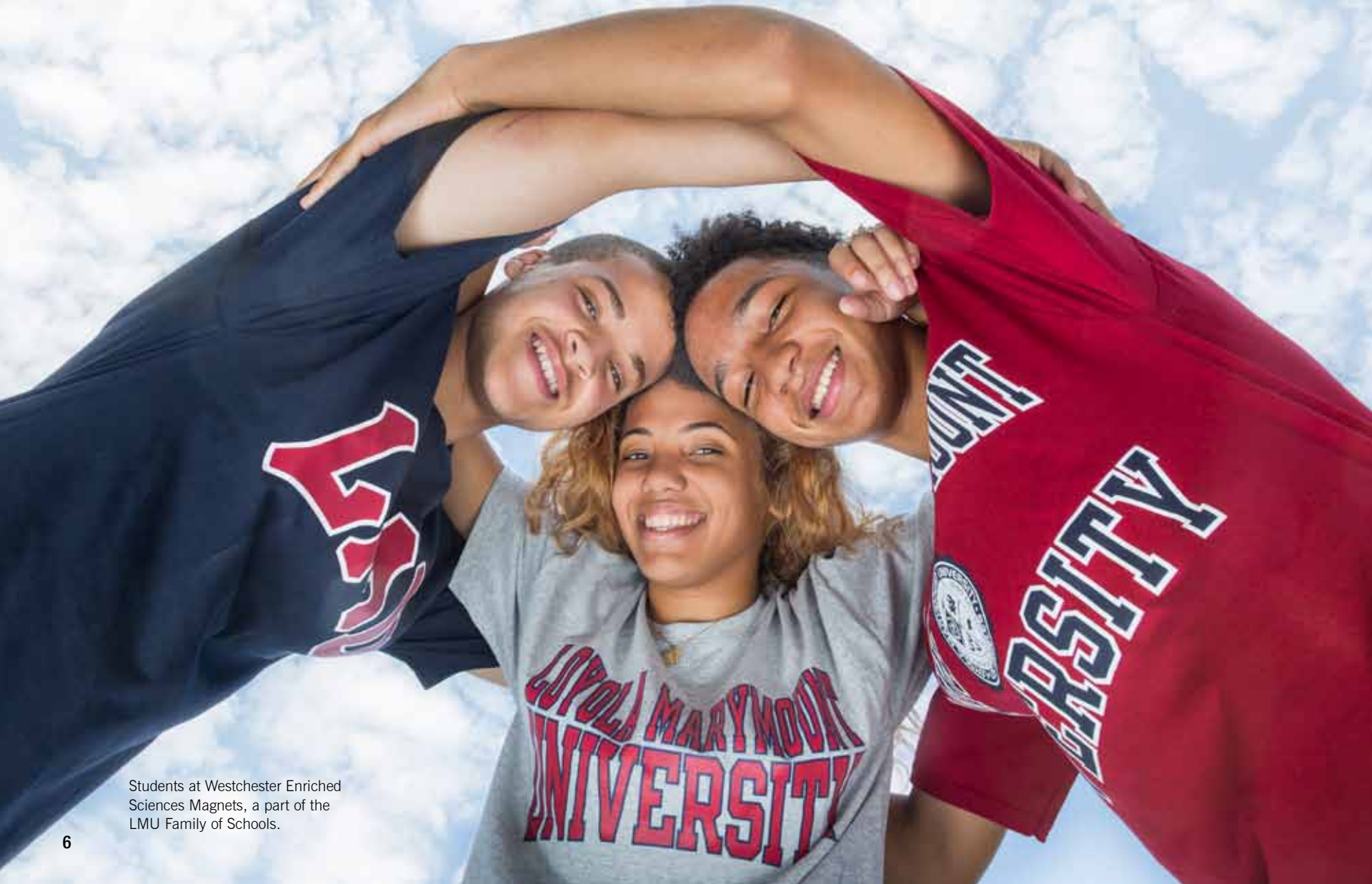
Students at Westchester Enriched Sciences Magnets, a part of the LMU Family of Schools.

We are a comprehensive School of Education, unique in our equal commitment to public, charter and Catholic education and determined to transcend traditional boundaries in pursuit of common goals. Through this approach, we continue to serve as a springboard for the next generation of leaders in public, charter and Catholic schools – change agents whose energy, talent and ability to unite disparate groups are transforming schools and communities.