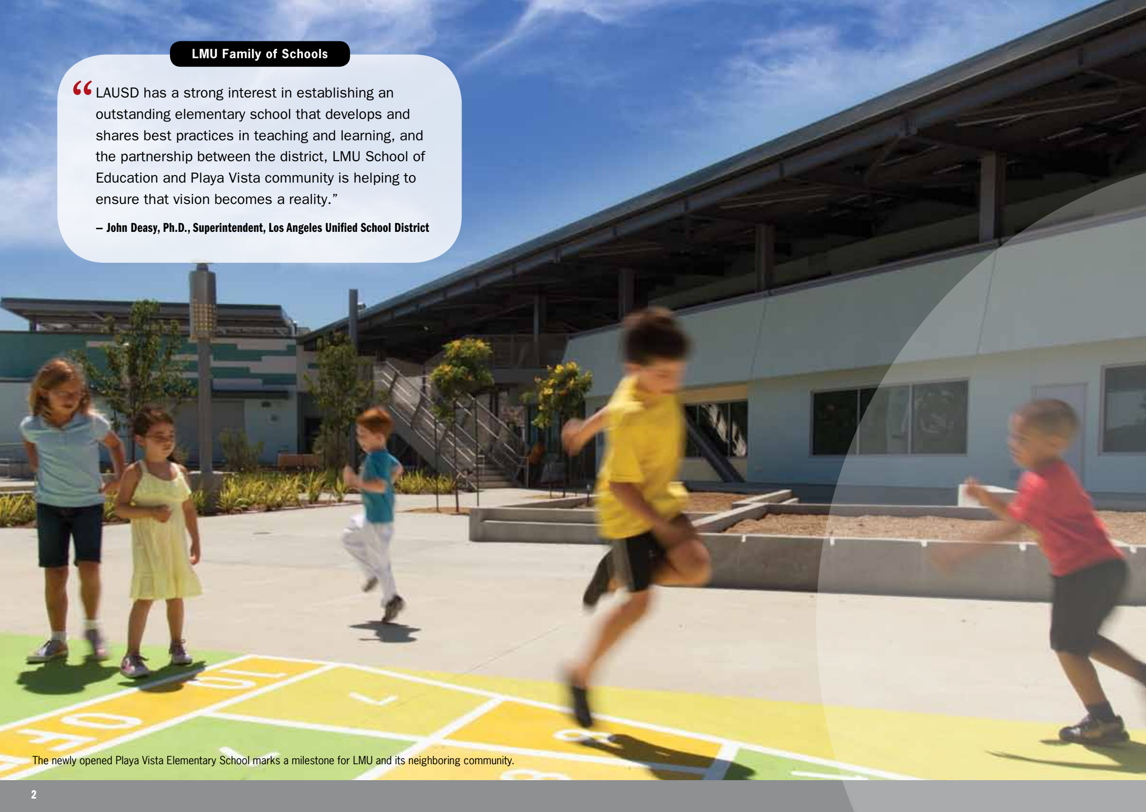
The newly opened Playa Vista Elementary School marks a milestone for LMU and its neighboring community.