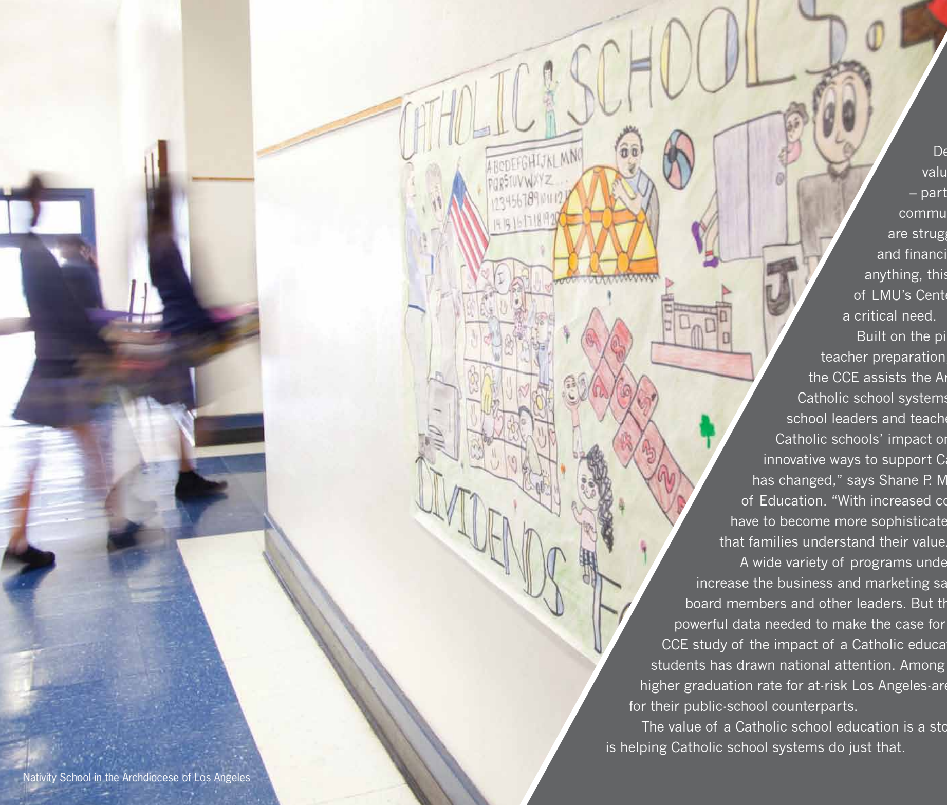
Nativity School in the Archdiocese of Los Angeles