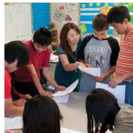
Teachers and students interact at the Chinese Bilingual Teacher Education Summer Institute, a collaboration between LMU and the federal STARTALK initiative.