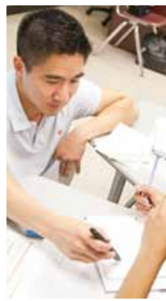
Teacher leaders collaborate in the CMAST-led Los Angeles Math and Science Residency.