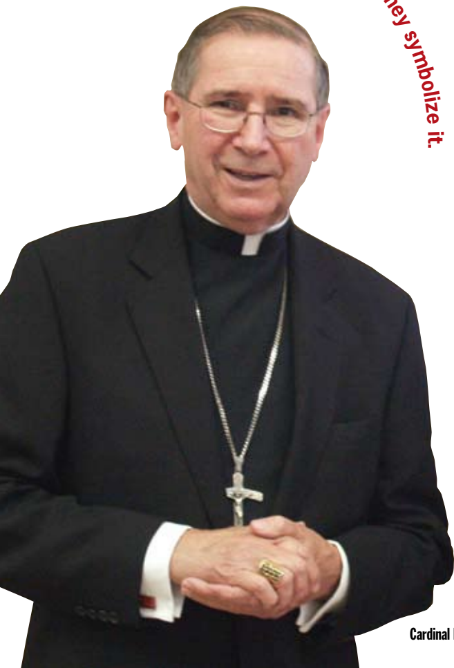
Cardinal Roger Mahony

Leaders don't resist innovation, they symbolize it.