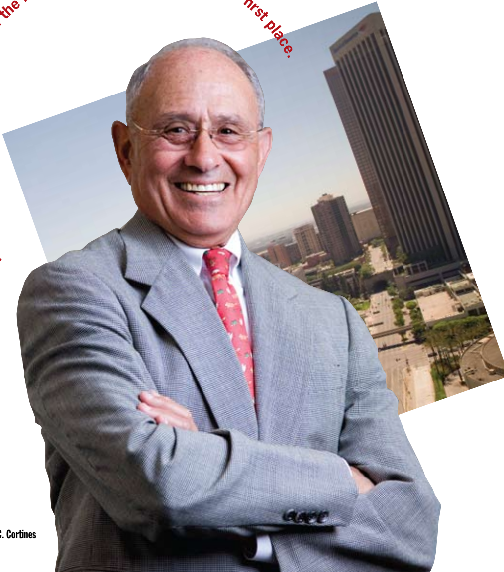
Ramon C. Cortines

The best way for people to think out of the box is not to create the box in the first place.