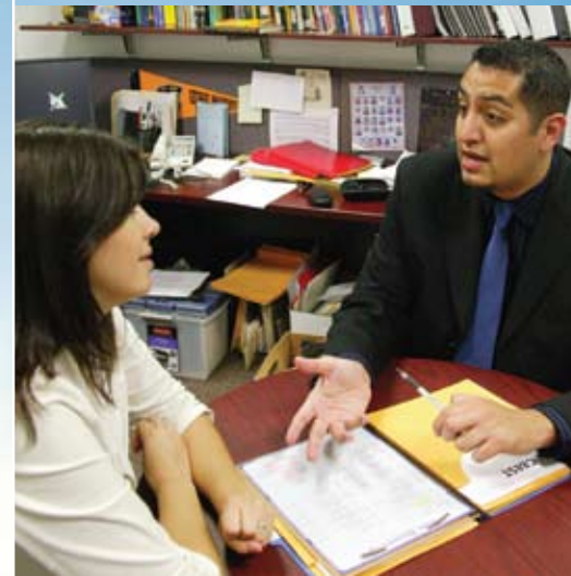
LMU's partnership with Teach For America is one of the largest in the country.

We are what we are because we have first imagined it.